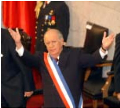
President Ricardo Lagos during his Message to the Nation, National Congress.

International Press Department • Communication and Culture Secretariat • June 8, 2005 • No.70