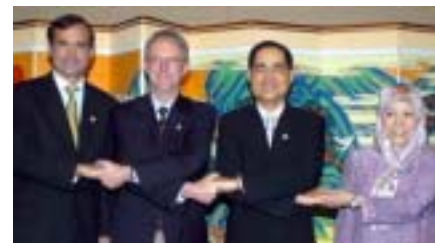
Foreign Minister Walker with Minister Jim Sutton of New Zealand, Minister Lim Hong Kiang of Singapore and Princess Hajah Masna of the Sultanate of Brunei. South Korea

During a meeting of the Asia-Pacific Ministers of Trade, Walker announced the signing of the Strategic Economic Association Agreement (known as P4) between Chile, New Zealand, Singapore and, Brunei Darussalam. Starting on January 1, 2006, the trade alliance will eliminate tariffs on more than 90% of the total trade between Chile and these three countries. With this agreement, Chile has taken an important step forward in its quest to serve as a leading platform for Asian investors in Latin America.