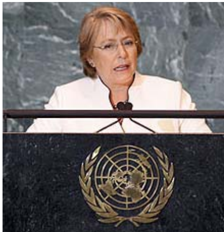
President Michelle Bachelet addresses the United Nations General Assembly.