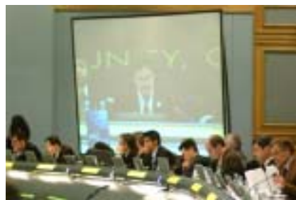
Second APEC Senior Officials Meeting (SOM). Santiago, June 2004.