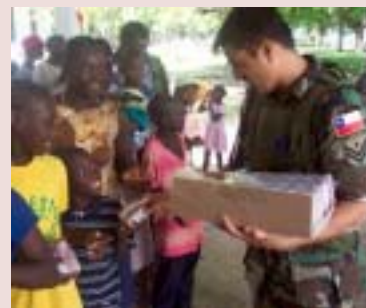
More than 12 tons of medical supplies were delivered by the Chilean Army battalion on assignment in Haiti as part of the U.N. peacekeeping force. The medicines were collected through a humanitarian campaign conducted by public and private institutions.