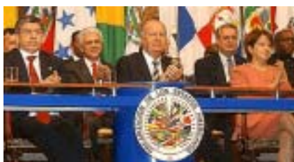
OAS Assembly, Santiago, June 2003

Its relationships with the Central American region, the Caribbean and Mexico are another important element in Chile's aspiration to create an axis for the promotion of democratic governance and social cohesion in Latin America. Concrete reflections of this aim can be seen in the trade increases achieved through the signing of a FTA with five Central American countries: Costa Rica, Honduras, Nicaragua, El Salvador and Guatemala; the 1996 agreement to establish a permanent Joint Working Commission with the countries of the Caribbean Community (Caricom); and Chile's FTA with Mexico.