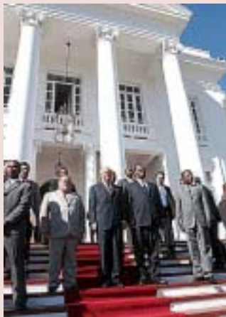
President Lagos with Haitian Prime Minister Gérard Latourte, in Port-au-Prince.

On August 16, Chilean ambassador Juan Gabriel Valdés became the head of the United Nations mission, with the goal of stabilizing and reconstructing the island nation. His mandate may be extended for another three years.