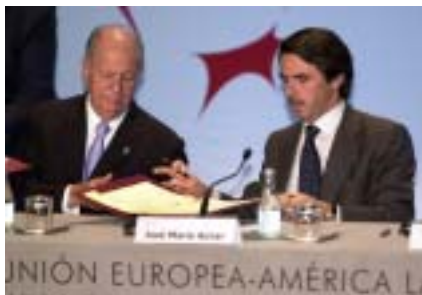
President Lagos and then-Prime Minister of Spain, José María Aznar, sign the Association Agreement between Chile and the European Union.

great leap forward in relations with the European Union.” The accord’s breadth extends to the political and cooperation arenas, making it “a model for those which the EU would like to sign with others,” as noted by Chris Patten, EU Commissioner for External Relations. The agreement is “the European Union’s most ambitious and extensive accord,” according to former Danish Foreign Minister Per Stig Moeller.