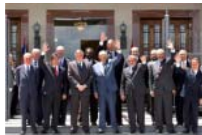
Mercosur Summit, 2003

For Chile, the most important issues within Mercosur include macroeconomic coordination, anti-poverty efforts, defense policy, culture and education, among others. In "Mercosur: The Challenge of Credibility," President Lagos referred to the bloc's future and its importance for