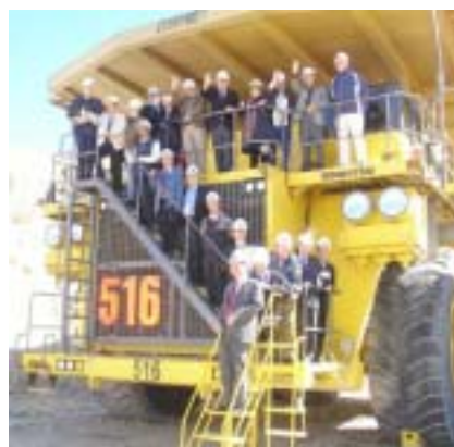
Meeting of APEC Ministers of Mining. Antofagasta, June 2004.