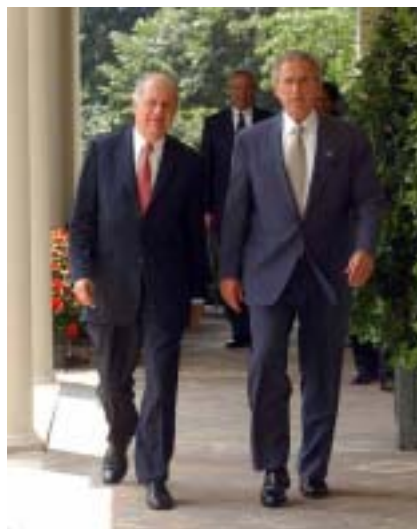
Presidents Lagos and Bush at the White House

President George W. Bush Washington, July 19, 2004