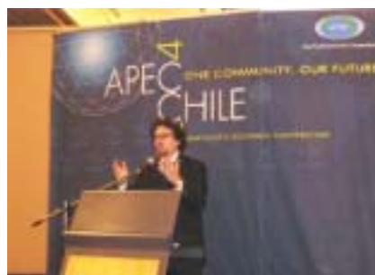
Ricardo Lagos Weber, Chile's Senior Official for APEC.

Chile's relationship with the Asia Pacific region has advanced even further than this. In February 2004, it signed an FTA with South Korea – the first between a Latin American nation and an Asian country – which will enter into force on April 1. Negotiations are currently in progress with New Zealand and Singapore. In addition, China, India and Japan have expressed interest in undertaking trade negotiations with Chile. ♦