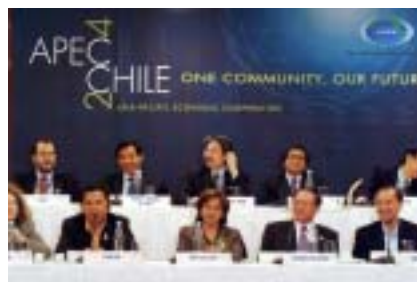
Minister Soledad Alvear participates at Meeting of APEC Trade Representatives. Pucón, June 2004.