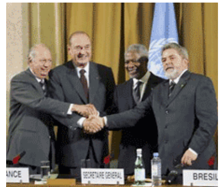
Presidents Ricardo Lagos, Jacques Chirac of France, and Lula da Silva of Brazil with U.N. Secretary-General Kofi Annan. Geneva, May 2004.

received President Lagos' immediate support. A technical group has been tasked with presenting a report, which will include concrete measures to obtain stable and ongoing financial contributions, making it possible to fulfill the Millennium Goals by 2015," stated Foreign Minister Soledad Alvear.