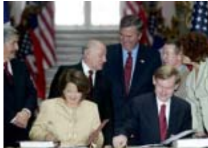
Foreign Minister Soledad Alvear and U.S. Trade Representative Robert Zoellick sign the FTA between Chile and the United States. Miami, June 2003

as “an important step forward for U.S. policy in Latin America,” emphasizing its significance for the region: “It could pave the way toward a hemispheric treaty much greater than NAFTA.” And for Chile, according to El Nuevo Herald , “the pact gives its products and services access to a much larger market, which will result in an increase of at least 1% in its GDP.”