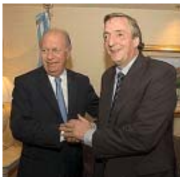
Presidents Lagos and Kirchner at Argentina's Casa Rosada

The quality and intensity of this bilateral relationship is reflected in the meetings of the countries' Foreign Ministers and Heads of Government, which have laid the groundwork for decisive advances in the pursuit of an integrationist agenda. In his latest visit to Buenos Aires, on August 31, President Lagos emphasized "the good state of relations with Argentina" and the historical relationship of cooperation between the two countries, above all in moments of crisis. The main topics addressed included the progress in physical integration between the two nations.