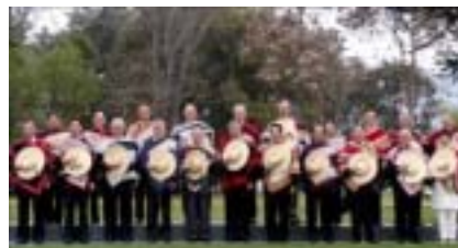
Meeting of APEC Finance Ministers. Santiago, September 2004.