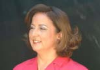
María Soledad Alvear Minister of Foreign Affairs

She holds a law degree from the University of Chile and a master's in Development Sciences from the Instituto Latinoamericano de Doctrina y Estudios Sociales, Ilades.