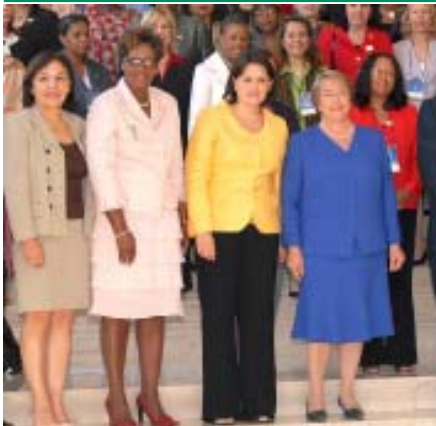
President Michelle Bachelet at the Thirty-Fourth Regular Session of Delegates from the Inter-American Commission of Women, CIM-OAS.