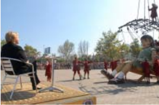
President Michelle Bachelet watches the "awakening" of La pequeña gigante (The Little Girl Giant), created by the Royal de Luxe theatre company of France and presented in Santiago from January 26 to 28.